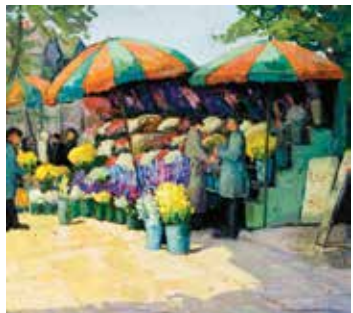
“Flower Stalls” (1932) by Virginia Woolley

sponsor events and programs that encourage the appreciation, study, and performance of the arts. Each year, the Festival of Arts produces two world-class events—the Festival of Arts Fine Art Show and the Pageant of the Masters—which together attract nearly 200,000 visitors annually to Laguna Beach. For general information visit www.LagunaFestivalofArts.org or call (949) 494-1145.