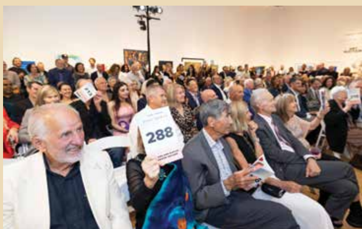
Collectors and supporters raise their paddles during the lively bidding