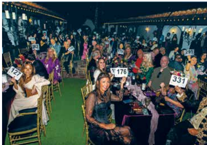
Guests enjoying the 2024 Toast to the Casa fundraiser event at Casa Romantica Cultural Center and Gardens

For more information, to sign up for early access to tickets for Toast to the Casa, or for details on exhibitions and programming, visit www.casaromantica.org and follow @CasaRomanticaSC on social media.