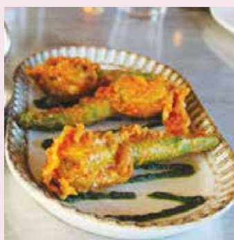
Appetizer tempura fried squash blossom