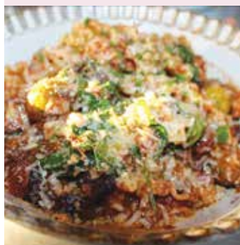
CUCINA enoteca signature Short Rib Mafaldine