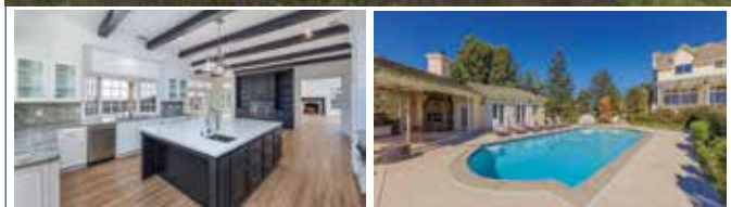
Fallbrook I Sold for $2,400,000 3875 Peony Dr. 1.5 bedrooms 5.5 bath 6,550 sq. ft. approx. Does not include guest quarters & pool house