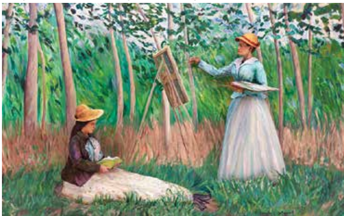
Blanche Hoschede at her heasel with Suzanne Hoschede reading by Claude Monet